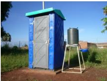
Workmen's new toilet & wash-stand