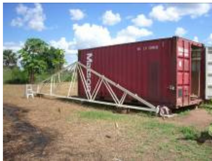
The first two roof trusses painted