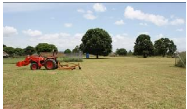
Property after slashing has been completed