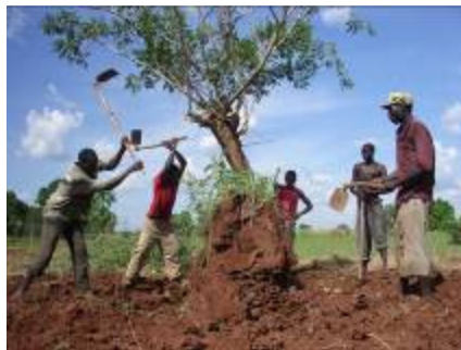
Removing tree stump