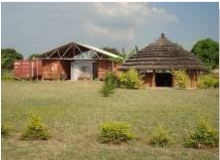
Containers, Room and Toucal