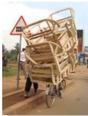
One way to move a lounge frame