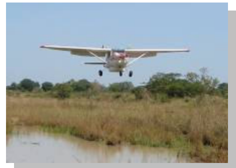
MAF Cessna landing at Pader