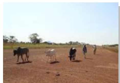
Cattle on the Pader airstrip